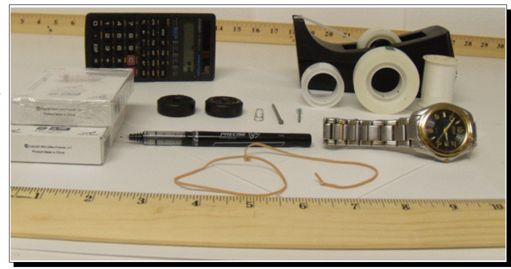
Figure 2 - Equipment you will need for experiments

together. And, there will be a Cub Lecture 3 , to teach you about how mass and weight work. This is the science of gravity, and how things fall. Figure 2 shows the things you will need to do the experiments to earn the award patch. Most of this stuff you have around the house.